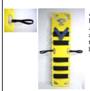
Step 5 Loop Wrist

Install Body Straps (black 3" wide straps) in the four designated handholds. (Leave center handholds clear for Wrist Retsraint attachment.)