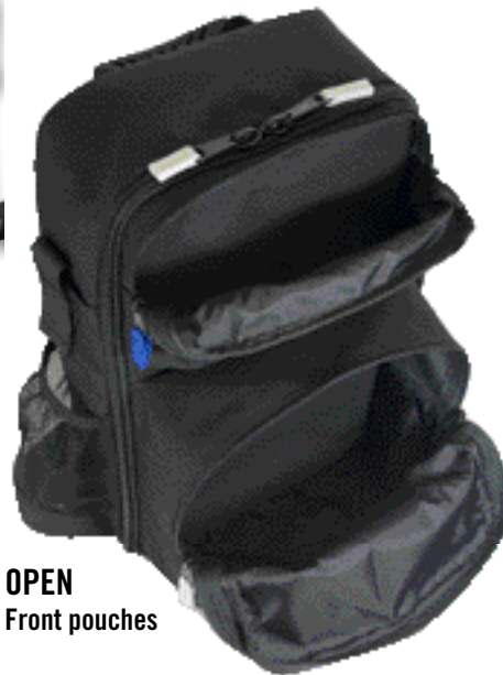
OPEN Front pouches