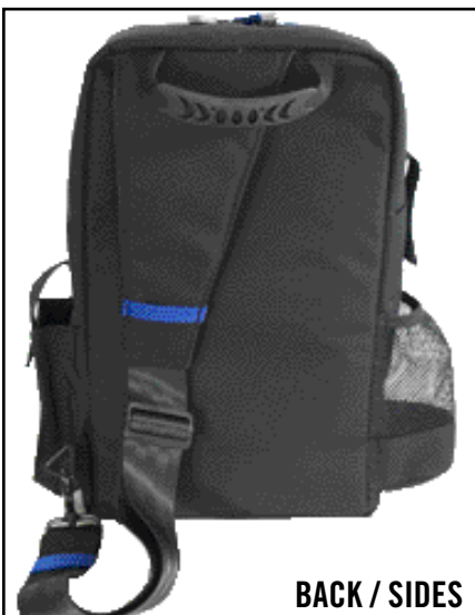
BACK / SIDES