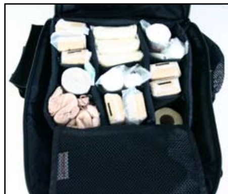
INSIDE INSERT (Contents Not Included)